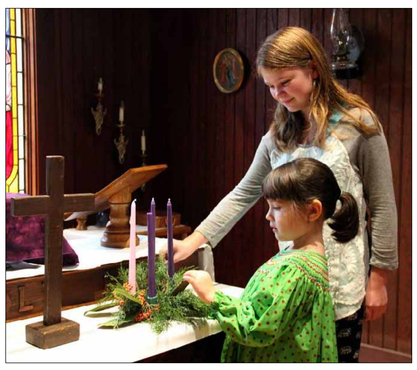
Christmas at St. Alban's Church